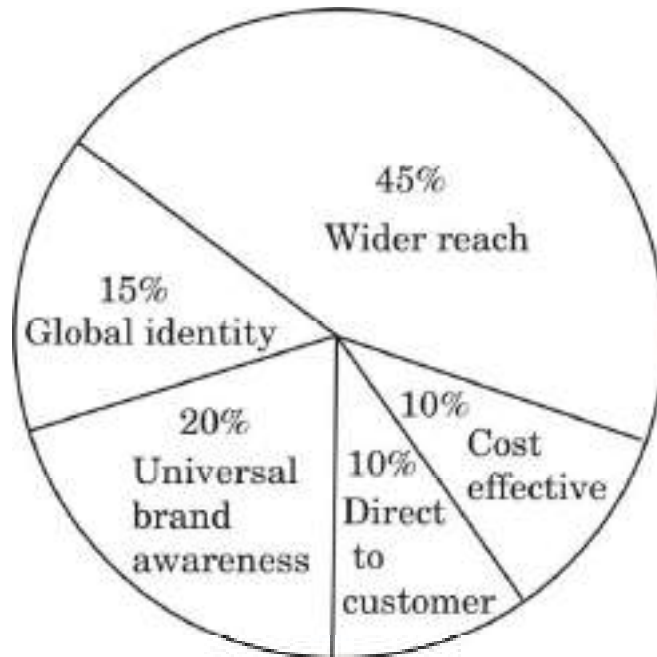
Digital Marketing Benefits